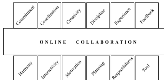
Figure 1: The factors affecting on-line collaboration

According to the findings of the study, the factors affecting collaboration in on-line courses are given in Figure 1. Apart from these factors, the participants proclaimed that some strategies used in on-line discussions such as discussion circles were effective, as student-student interaction had the highest value. According to student feedback, it was also found that the provision of a platform in which all students or the group members could meet at a particular time and discuss the projects each week may be an effective strategy to promote effective peer interaction. The discussion is synchronous in nature; however, the forum tool will be used instead of chat tool as in the traditional synchronous communication. This is something similar to 8:30 classes in the traditional learning settings.