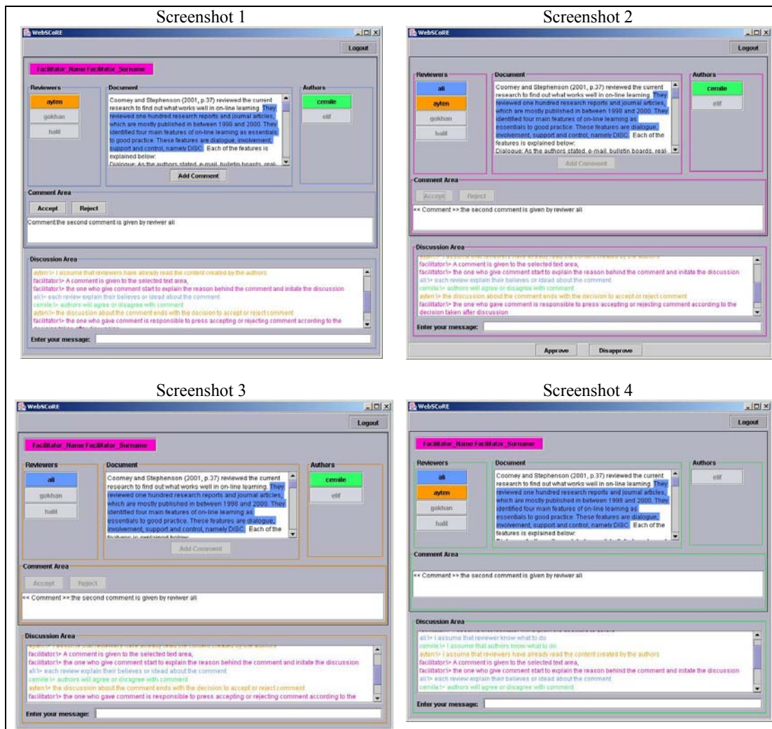
Figure 4: View from a review session with four users

The participants of the application were the research assistants and graduate students. They were responsible for creating and reviewing the user manuals developed for a learning management system. All participants have the knowledge and experience regarding document reviewing. We constructed each review with at least three users: a facilitator, a reviewer and the author. At the end of the application of WebSCoRe, we had six review sessions. We then interviewed the participants and asked about the effectiveness, strengths and weaknesses of WebSCoRe. The semi-structured interview approach was used. The average time for the interviews was 40 minutes. We analyzed the interviews using qualitative analysis procedures.