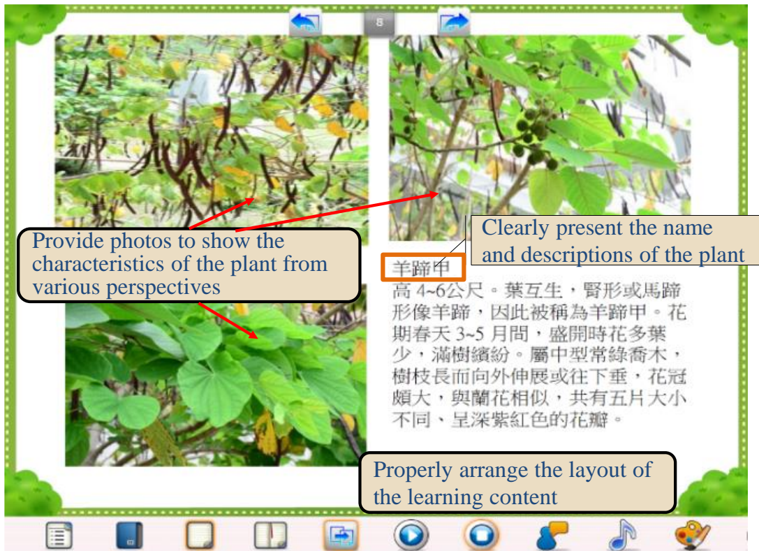
Figure 2. Illustrative example of a student's e-book with a good score in the "Content" dimension