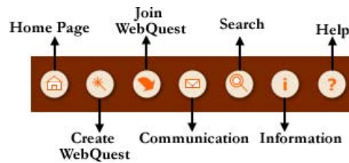
Figure 2. WebQuest navigation bar

To join a WebQuest and to create a WebQuest, students and instructors have to start the procedure of getting a “passport” by filling out an application form. After the site administrator has approved their application for a passport, they can enter the site by supplying a user name and password. The navigation bar on the top right side of the WebQuest system includes all operations for WebQuest (Figure 2).